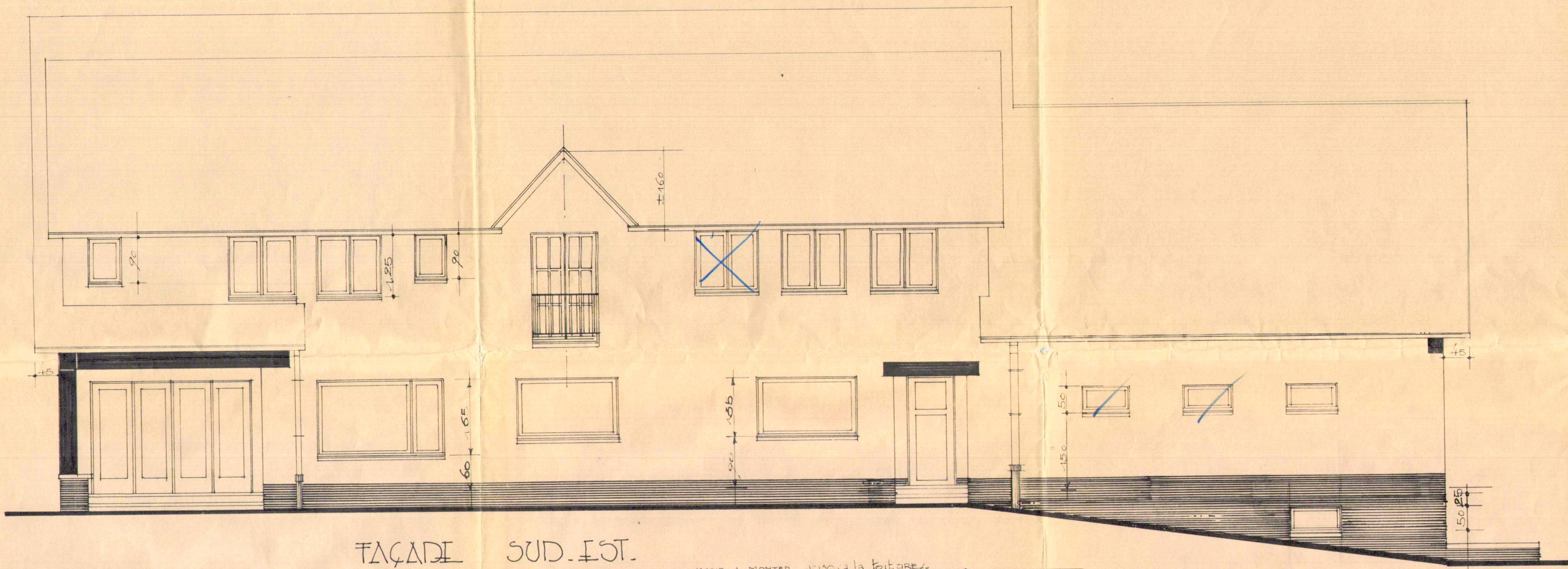
FAÇADE SUD. EST.